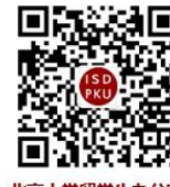
北京大学信息服务